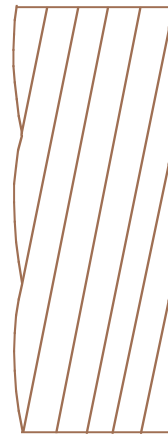
Right Hand Lay or "Z" direction